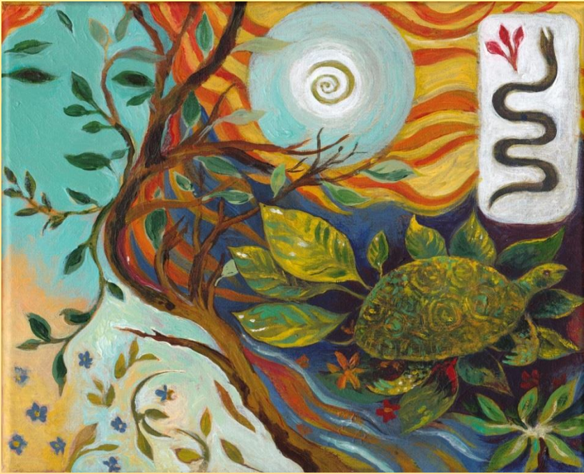
Elaine Clayton copyright 2013 Illuminara.com